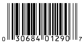
Organic Free Range Chicken Broth

Organic Beef Flavored Broth – Organic Beef Broth (Filtered Water, Organic Dried Beef Stock), Organic Beef Flavors (Organic Beef Flavors, Sea Salt), Sea Salt, Organic Beef Fat (Organic Beef Fat, Tocopherol), Organic Caramel Color, Natural Flavor (Natural Yeast Extract), Organic Flavor (Organic Garlic Flavor, Organic Sunflower Oil).